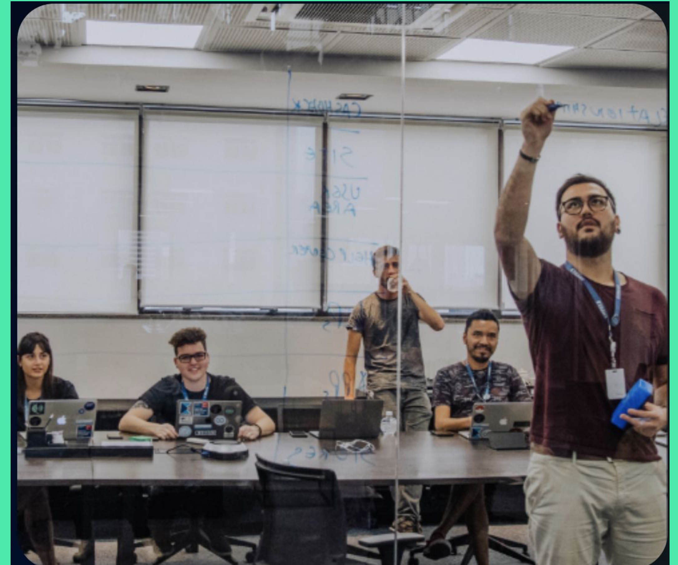
EBANX Disruptive Culture Soccer analogy